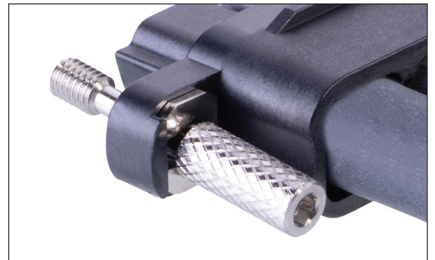
Close-up on thumbscrews fitted to cable connectors