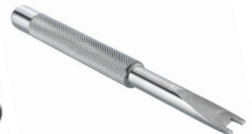
ZA1-9020000 Slotted Screwdriver