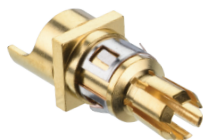
KA1-1410005 Male 8AWG Solder Contact