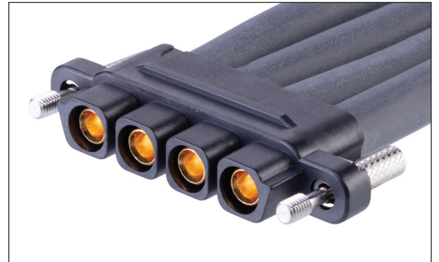
Assembled female cable connector, 4 contact