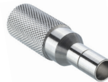
ZA1-9040000 Contact Removal Tool