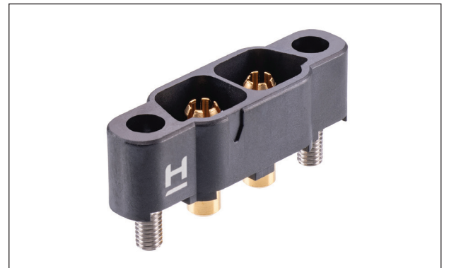
Male throughboard connector, 2 contact